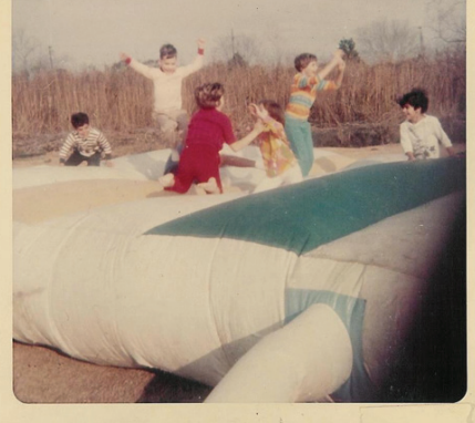
The first ever inflatable attraction

Inflatables are likewise alluded to as jumping castles, bouncy houses, fun mansions, inflatable bouncers, moonwalks, spacewalks, party jumpers, inflatable rides, and so forth. After some time, increasingly more inflatable delight gadgets have been created in the business, for example, inflatable slides, inflatable obstruction courses, inflatable climbing dividers among others. Please read on to know more about the historical backdrop of inflatables, who designed the inflatable and when bounced houses got well known.