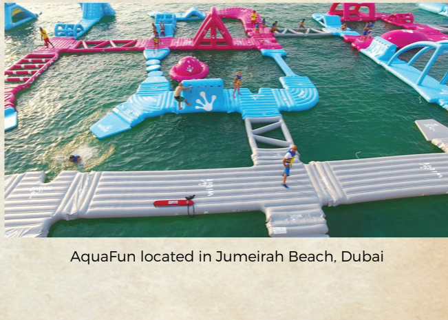
AquaFun located in Jumeirah Beach, Dubai

must schedule for anybody searching for some beachside thrills. Although it might be difficult to see from the beginning, whole drifting park actually says 'I love Dubai'. AquaFun keeps both children and grown-ups engaged for quite a long time. AquaFun is an ideal way to have some fun in the sun. It has become one of the Top 5 Water Parks in Dubai and provides an unrivalled platform for companions, families and gatherings. Being the largest inflatable Water Park, they have become a 'must-do' activity while in Dubai.