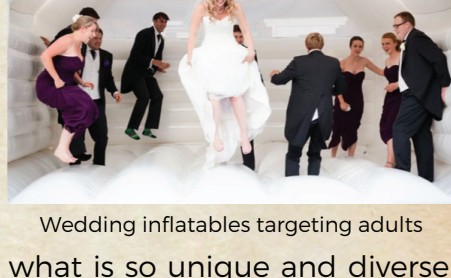
Wedding inflatables targeting adults

After the initial design of inflatable jumping castle hit the markets in the 1970s and 80s, party rental companies started to capitalize on the trend and began designing various other fun inflatable structure for parties and events, such as inflatable dry slides and water slides, bounce house with slide combos, crazy inflatable obstacle courses and mazes, interactive sport games and water games, etc. Various styles and designs for you to choose from when planning a child's birthday party. This is what is so unique and diverse about inflatable equipment in the present day.